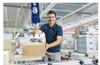
Lifting systems and cranes